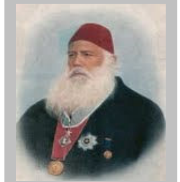
A Picture of Triumph Against All Odds

I hope you will try to set an example in both scholarly pursuits and the practice of Islam. Only then will our community be honoured and respected.